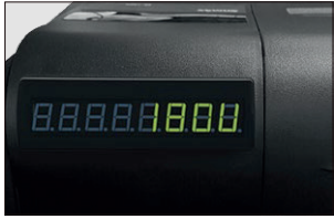
Large Character LED Display for Customer