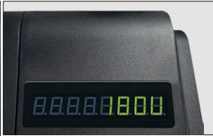
Large Character LED Display for Operator