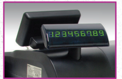
• Adjustable Rear Customer Display.

Choose a single printer or traditional receipt & journal model. Both provide fast, quiet thermal printing.