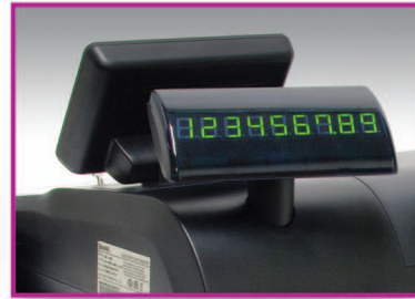
• Adjustable Rear Customer Display.