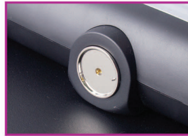
• Optional Dallas Key Sign-on (With 5 Keys).