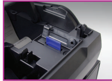
• Discreet Secure SD Port.