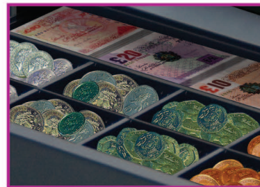
• Large Cash Drawer (8 Coin & 4 Note).