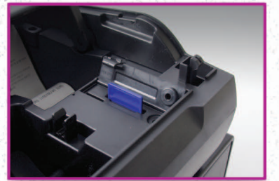
• Discreet Secure SD Port.